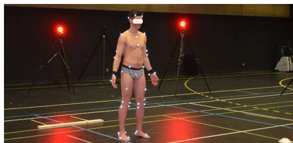
Figure 1 Experimental set up

and to left side. To do this, the participant had to bend his knee allowing the pelvis to tilt to the same side. The test was explained to the participants and repeated several times before the recordings (Figure 1). After a static trial, participants were instructed to perform the right and left one-sided tilt test in an alternate sequence.