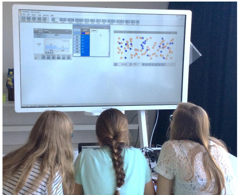
Figure 1: An impression of the setup in the Learning Lab

We have chosen to run the pilot in a lab setting. The advantage of this lab setting, over a classroom environment, was that detailed recordings could be made of the actions and conversations of several teams of students working on the same assignment at the same time. During a five-hour session, seven 9th-grade students worked in teams of 2 or 3, on tasks addressing steps 1 to 4 of the learning trajectory. This pilot was repeated in a similar five-hour session, with seven other students. The teams worked on a laptop, the screen of which was displayed on an interactive whiteboard. Camera recordings of their actions on the screen were made, and student conversations were recorded. Students noted their findings as a team on a student worksheet. We worked with students from pre-university level, the