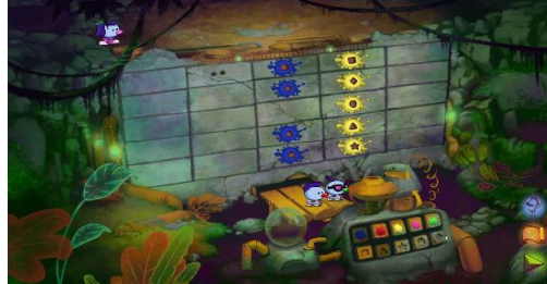
Figure 2: Damian’s third playthrough, one Zoombini has made it over the wall successfully

In the third playthrough (Figure 2), Damian focused on keeping the colour constant and changing the shape. Once the column with the yellow shapes was completed, he tried to complete the blue column until his mud finished. During this playthrough, Damian identified the relationship of colour and shape to columns and rows of the tiled wall.