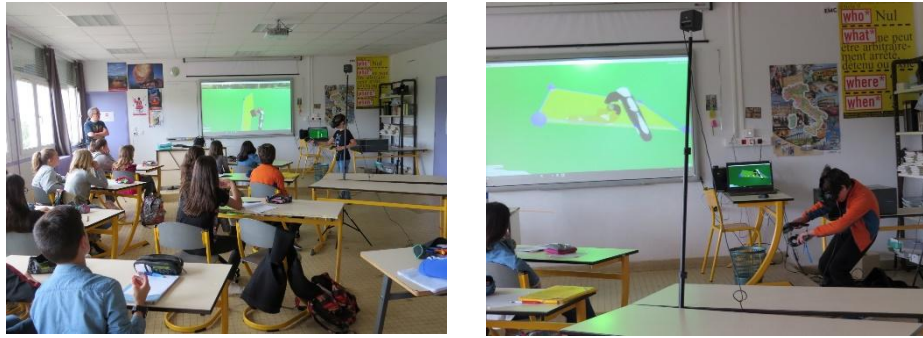
Figure 2. The classroom setting and the generation of a prism using the stretch operator

The implementation went through the following phases in the classroom setting shown in Figure 2 (left):