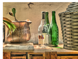
Fig. 4. (Up) Duan with global processing; (Down) Duan with local processing.