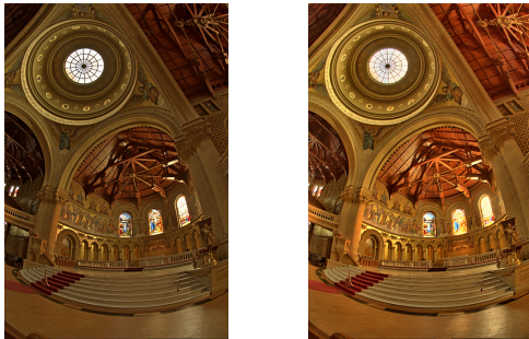
Fig. 7. (Left) Li (Haar multiscale) with post-processing; (Right) Proposed with local post-processing.