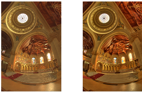
Fig. 6. (Left) Fattal (RBW, \alpha = 0.8 , \beta = 0.3 , \gamma = 0.8 , J=2 , upd=0 ); (Right) Proposed with local post-processing.