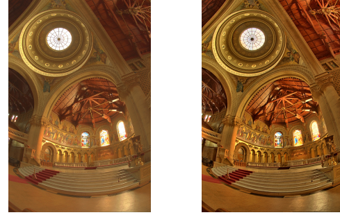
Fig. 8. (Left) SEP ( \beta = 0.3 , \gamma = 0.7 , J=2 , upd=0 , b = e ); (Right) Proposed with local post-processing.