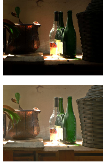
Fig. 2. (Up) Without adaptive weighting ; (Down) With adaptive weighting ( \varepsilon = 10^{-9} ; J = 2 ; \gamma = 0.6 ; \xi = 0.1 ).

Figure 2 clearly shows the impact of the second stage on the visual quality of the LDR image.