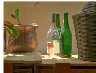
Fig. 3. (Up) Proposed ( \varepsilon = 10^{-9} ; J = 2 ; \gamma = 0.6 ; \xi = 0.1 ); (Middle) Proposed with global post-processing; (Down) Proposed with local post-processing.