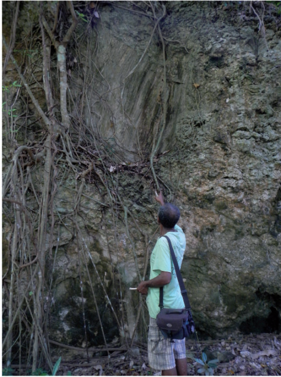
Figure 4. Coral throwing club ‘quarry’, Aniwa Island.

Shell and stone pendants are significant exchange items in south Vanuatu, known from ethnographic and archaeological collections (Haddow et al., 2018). Most of the archaeological examples date to the last 400 years or less, and are distinctive from the much older Lapita and post-Lapita valuables found at sites such as Ponamla on Erromango Island (Bedford, 2006: 204–209; Haddow et al., 2018: 108–109). A specific type of pearl shell pendant commonly found in ethnographic collections, which is carved to represent various animals, including fish, lizards, flying foxes, and antlion larvae, is usually attributed to south Vanuatu (e.g. Flexner, 2016: 146). Most commonly, this type of pendant is sourced to Futuna, and we have excavated at least one archaeological example. It is possible that this pendant form originated in Futuna and then spread to neighbouring islands. Carson (2012: 39–40) posits that distinctive pendant forms may have been a marker of identity elsewhere in Vanuatu and more widely among the Polynesian Outliers.