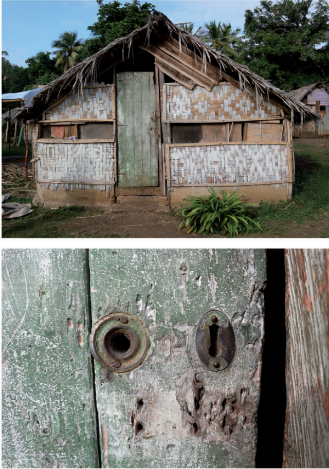
Figure 3. Door from the historical mission church integrated into a 'traditional' Aniwan house (above); detail of the original lock (below).