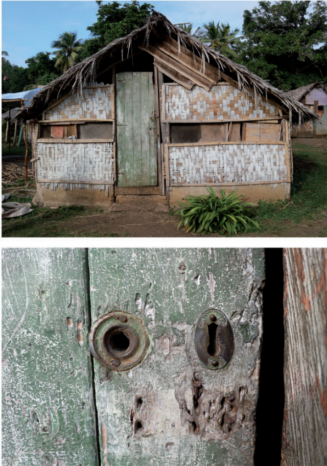
Figure 3. Door from the historical mission church integrated into a 'traditional' Aniwan house (above); detail of the original lock (below).