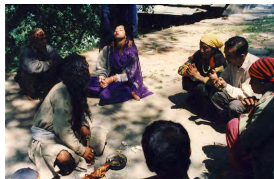
Banita becomes behos during the consultation ( deopuchna ). Kullu district 1995

As soon as the deopuchna started, the medium got up, took the young woman by the hair and pulled her up. He first began to openly question the bhut :