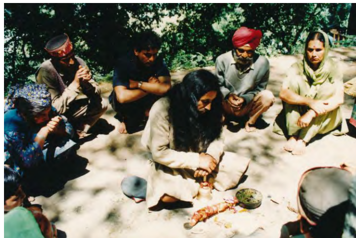
Consultation at the temple of the goddess Shrivani, Shuru 1995

The institutional and ritually controlled context in which people are directly confronted with possession occurs during the so-called deopuchna (questioning the god), which are ritual consultations held at the temple of the village deity. Deopuchna may be organized either on the request of one person or of family members who wish to submit a personal problem, or on the request of those in charge of village affairs to discuss a subject of public concern. At the beginning of deopuchna , the medium of a particular village deity, after donning special clothing, sits near the temple entrance and, using specific ritual techniques, he invites the deity to enter into him. At the time of deopuchna , both the deity's entry into the medium and its exit are a well-delimited moment ritually defined by a beginning and an end through specific ‘signs’ that may vary slightly from one medium to another: a sudden trembling of the medium's shoulder, some incomprehensible words, the playing of a bell - to quote just some examples.