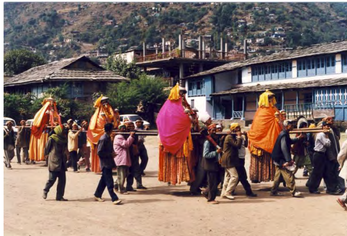
Villagers bringing their deities' palanquins to the festival

palanquins on their shoulders; the palanquins are supposed to move or ‘behave’ according to the deity's will. Raths are supposed to be endowed with intentionality and with the capacity to move and to interact amongst themselves and with people. Although the god- rath is said to be the same god who lives in the temple, the personality of the god particularly emerges through the rath . These ‘gods- rath ’ are treated like living being whose individuality is recognizable by villagers thanks to the different decorative elements of the god: the specific form of the rath , the main colour of the clothes, the jewellery, etc. They are also like living puppets that people have to take care of and play with. When the rath is carried to the sound of music, the god may also ‘dance’, ‘play’, ‘run a race with another rath ’, it may encounter his/her loved one: his father or mother; a brother may encounter his sister or his friend). There is an actual coded set of emotions which may indicate how a god- rath feels at a specific moment: is he angry, or happy, does he want to ask the villagers something? A rath may also be asked to give his opinion about something or to give a reply: there is a coded language which has to be interpreted by people according to the social context. The god’s intention may be clarified through the god's official medium, though it may happen that the god expresses something different through the medium and through the palanquin.