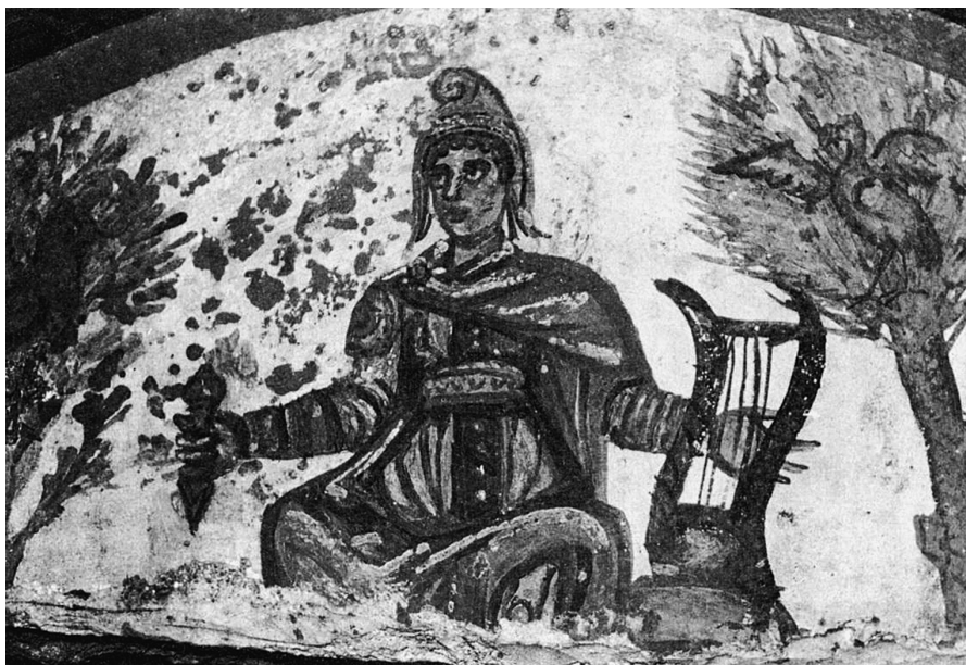
Fig. 2. Orpheus, Peter and Marcellinus catacomb, Rome, early 4 th c.

mosaic represented on figure 2 dates back from the beginning of the fourth century (310-330) and is painted in the tympanum of the left arcosolium. Orpheus is shown in the same dress and in the same frontally-seated position as in the mosaic of Saint Callixtus. With his left hand he touches the lyre which is resting on a rock. He seems, however, to have halted in his playing since his right hand in which he holds the plectrum is held out towards his left, while his large eyes gaze into the far distance. The figure is flanked by two trees which are bending towards him. In the tree on the right perches a bird of prey with outstretched wings. It may represent an eagle. The nature of the bird on the left is impossible to determine. There are no quadrupeds, but there may have been some in the lost part of the painting. Naturally, we do not know their nature, peaceful or ferocious.