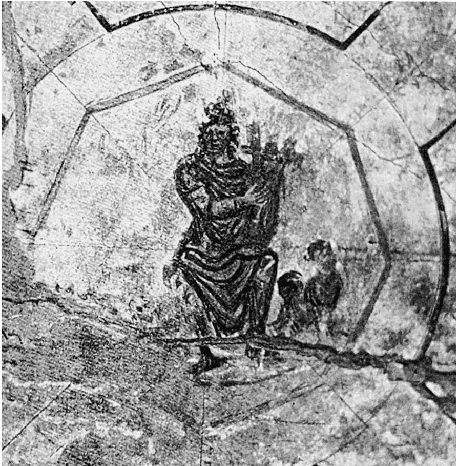
Fig. 1. Orpheus, Saint Callixtus catacomb, Rome, early 3 rd c.

characteristic type of catacomb painting. Here the only indication of the Christian context, apart from the presence of only peaceful animals, lies in the fact that the construction of the catacomb began with Pope Zephyrinus (203-218) and was completed under Pope Callixtus (218-228).