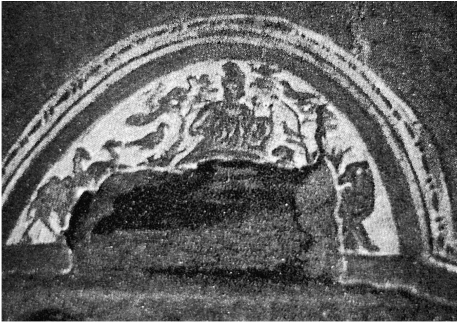
Fig. 3. Orpheus, Domitilla catacomb, Rome, around 360 AD.

frame around the figure and have several birds on their branches, including a peacock. On the right stand a lion, a camel and a sheep; on the left there might be an ostrich and another camel.