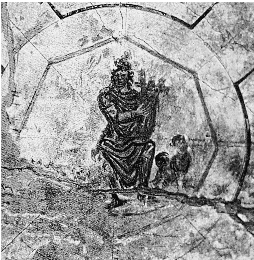
Fig. 1. Orpheus, Saint Callixtus catacomb, Rome, early 3 rd c.

characteristic type of catacomb painting. Here the only indication of the Christian context, apart from the presence of only peaceful animals, lies in the fact that the construction of the catacomb began with Pope Zephyrinus (203-218) and was completed under Pope Callixtus (218-228).