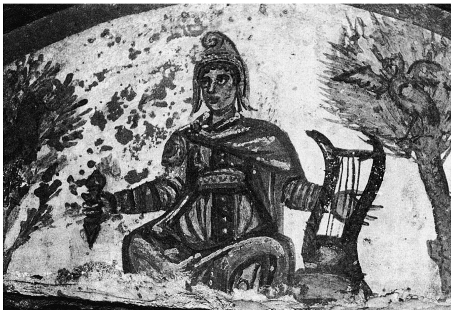
Fig. 2. Orpheus, Peter and Marcellinus catacomb, Rome, early 4 th c.

mosaic represented on figure 2 dates back from the beginning of the fourth century (310-330) and is painted in the tympanum of the left arcosolium. Orpheus is shown in the same dress and in the same frontally-seated position as in the mosaic of Saint Callixtus. With his left hand he touches the lyre which is resting on a rock. He seems, however, to have halted in his playing since his right hand in which he holds the plectrum is held out towards his left, while his large eyes gaze into the far distance. The figure is flanked by two trees which are bending towards him. In the tree on the right perches a bird of prey with outstretched wings. It may represent an eagle. The nature of the bird on the left is impossible to determine. There are no quadrupeds, but there may have been some in the lost part of the painting. Naturally, we do not know their nature, peaceful or ferocious.