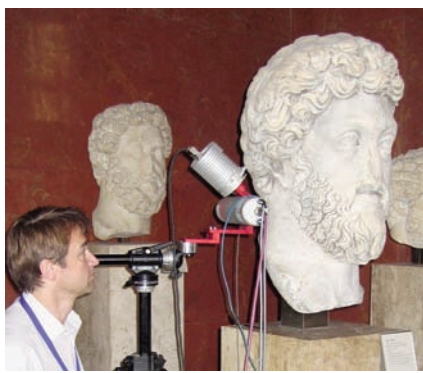
Figure 1. Portable X-ray fluorescence system and sculptures Ma1163 and Ma5101 of dolomitic marble presumably from Thasos.

The dolomitic marble sculptures in this series of tests document in various ways the diffusion of Thasian sculptural marble throughout the vast territories of the Rome Empire. Tested objects stem from the eastern shores of the Mediterranean to the Atlantic coast of France (Figure 4). The portrait of a man wearing a leafy crown of a civic dignitary, Ma3294, comes from Smyrna, modern Izmir on the Aegean coast of Turkey (cat69; Hamiaux, 1998). A head of a philosopher in dolomitic marble was bought in Syria and was probably carved there, Ma3621 (cat254; Hamiaux, 1998). A head of Sarapis, Ma1830, comes from