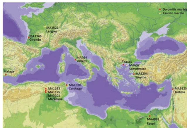
Figure 4. Map showing the location of the sculptures studied and Thasos and Malaga, ancient sources of dolomitic marble.