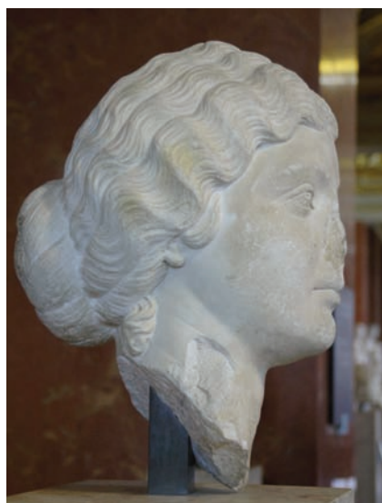
Figure 5. Portrait of Faustina II, empress 161-175 AD, found at Markouna, Algeria, Louvre, Ma 1175; dolomitic marble presumably from Thasos.

Carthage in Tunisia (Atlas database, 2010). A sarcophagus of dolomitic marble decorated with figures in Rome, Ma1346, was found at Saint-Médard-Eyrans, near Bordeaux (Baratte and Metzger, 1985; Astier, 2010). This heavy object must have been transported from Rome to western Gaul via the Atlantic Ocean.