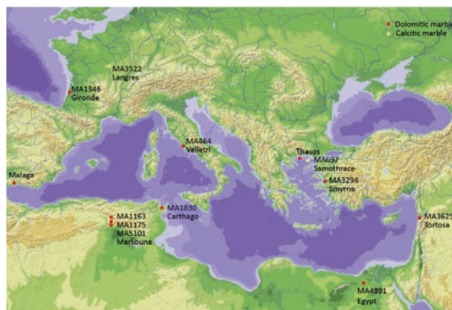
Figure 4. Map showing the location of the sculptures studied and Thasos and Malaga, ancient sources of dolomitic marble.