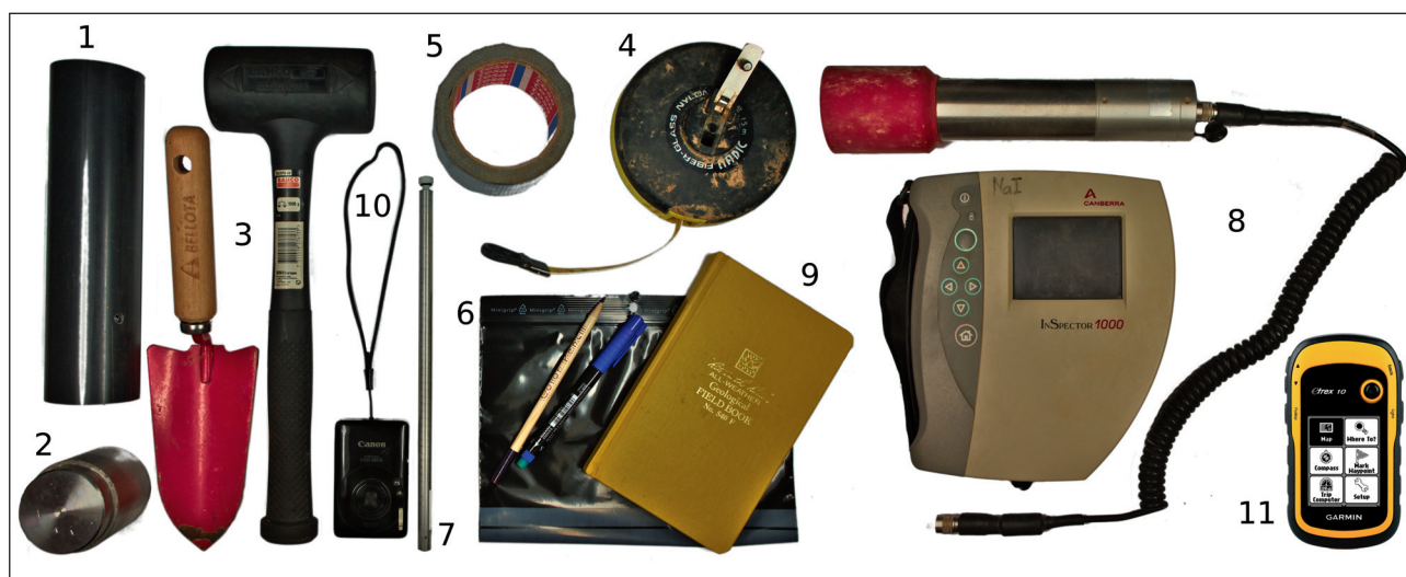
Fig. 1 : Example of field material necessary for ESR sampling

(1) PVC or metal tubes, (2) metal cap, (3) hammer and hand trowel, (4) measuring tape, (5) Duct tape (6) opaque ziplock bag, dark-colored permanent pen and pencil (7) dosimeter, (8) field-portable gamma spectrometer, (9) field notebook, (10) photo camera et (11) portable GPS.