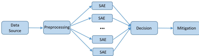
Fig. 2. Proposed anomalous communications detection architecture using a set of sparse autoencoders (SAE)

the proposed architecture. First, network communication data are preprocessed to extract useful features (described in Section III-C). The preprocessing step also include features normalization. The normalized data is then fed to multiple sparse autoencoders. Indeed, for each IoT device type present in the network, one different sparse autoencoder has been trained to learn its legitimate communication profile. Next, a decision module takes the outputs of all the sparse autoencoders and determine whether a communication is anomalous or not. Finally, the role of the mitigation module is to block communications detected as being anomalous.