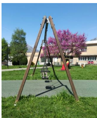
Figure 1: Pendulum equation as a function of time

We now show an example of activity that has been published. The task in Figure 1 was created by a teacher from Lecco (a city in Northern Italy) for students of grade 11.