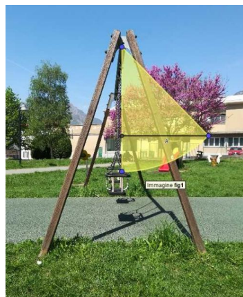
Figure 4: Explanation of the solution