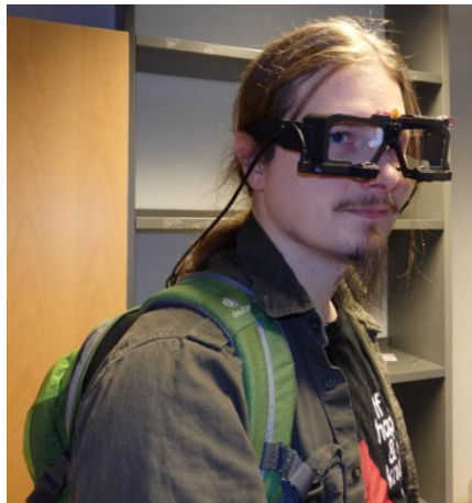
Figure 1: The gaze-tracking equipment.

We recorded the actions and conversations of the problem-solving session using audio recording and three stationary video cameras in the classroom. In this paper, we analyze data from five gaze-tracking glasses that recorded eye movements of the teacher and the target students. The gaze-tracking device consisted of two eye cameras, a scene camera, and simple electronics attached to 3D-printed frames (Figure 1). The devices and software were self-made (see, Toivanen, Lukander, & Puolamäki, 2017). The camera frame rate depended on lighting conditions, and maximum rate in optimal conditions was 30 frames/second. Data was recorded on laptop computers that were carried in backpacks allowing subjects to move freely in the classroom.