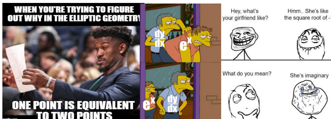
Figure 5: Example 1 (left), Example 2 (centre), Example 3 (right)

Finally, examining the memes' specialized meaning, further clarified in the coupled videos, we completed the possible analysis in Table 1 (videos – in Italian - can be seen downloading the HP Reveal app to a smartphone, following lfeonmath and then scanning the images in Figure 5 – due to monitor light reflections, it works better with printed images).