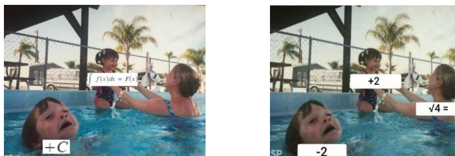
Figure 3: Drowning kid in the pool correct (left) and wrong (right) memes

To focus more on the concept of mathematical Internet memes and illustrate their epistemic potentiality, we shall analyse two examples of the Drowning kid in the pool meme (Figure 3), used to describe a situation where something is typically forgotten. On the left a correct version posted in May 2018 within a Reddit thread , where was identified as “the quintessential math joke”, on the right its wrong variation, posted in another Reddit thread in June 2018.