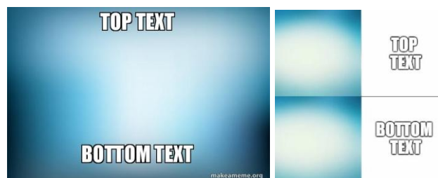
Figure 1: Two prototypical meme structures

They are deeply rooted in visual media culture and catch users’ attention with their puzzling vibe that calls for the active contribution of the viewer to unlock the meaning and thus adds a gratifying flavour. Internet memes are created by users according to collectively established and shared rules that govern the so-called memesphere : these rules dictate the conventional meaning of the pictorial parts and the position, font, syntax and narrative structure of the text, they “cannot be enforced by a specific person, but the community sanctions wrong uses by downvoting, not liking or simply not spreading the misused meme” (Osterroth, 2018, p.7). These same rules shape meme generators websites as https://imgflip.com/mememplates or https://makeameme.org/ : there are several accepted structures, two of the most common being those in Figure 1.