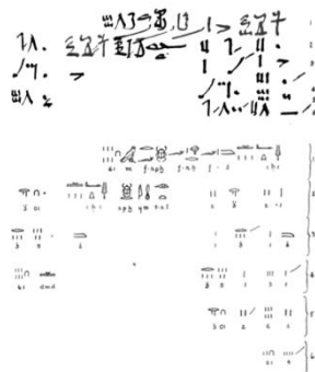
Figure 2: Hieratic and Hieroglyphic solutions of Problem 25