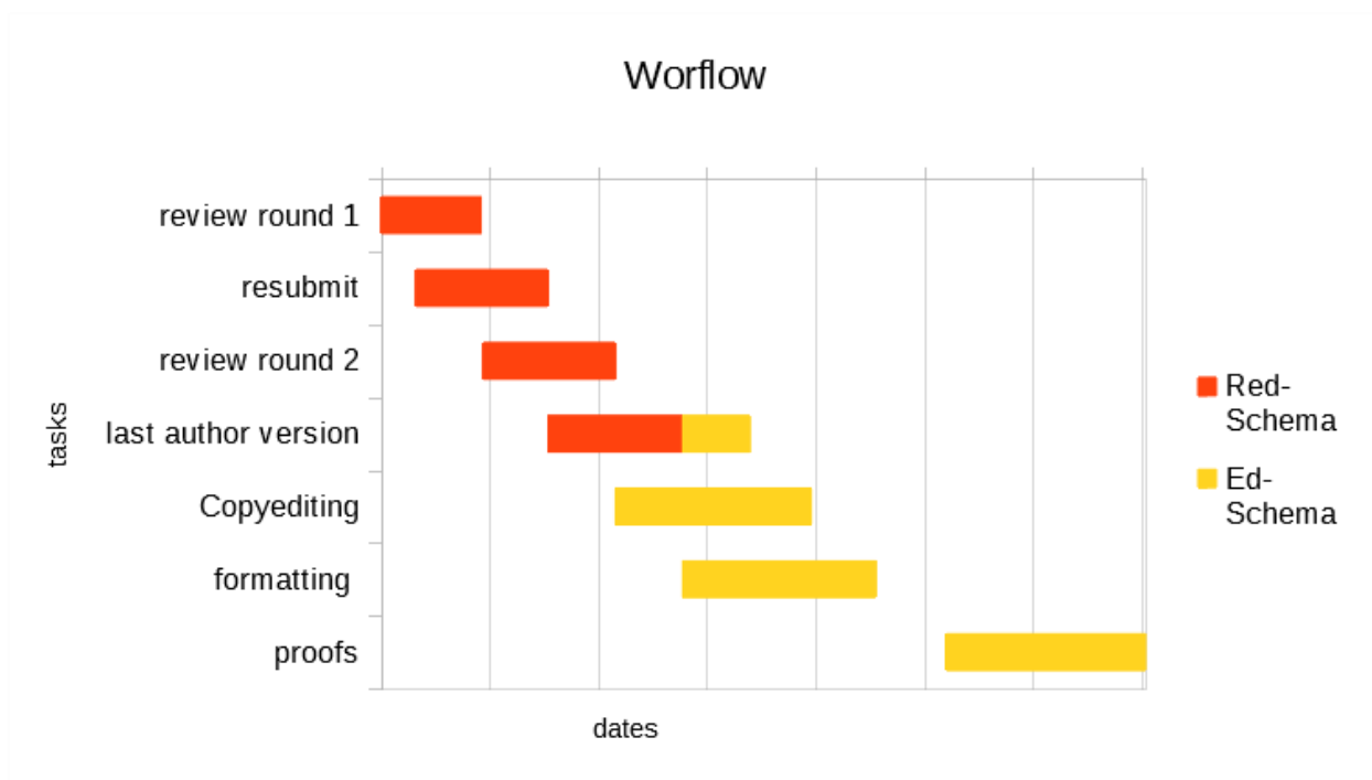
Figure 1. Workflow pattern

The graph in figure 1 is a simplified representation of the annual workflow of the journal Philosophie Antique . Each article submitted and published by the journal goes through the same process.