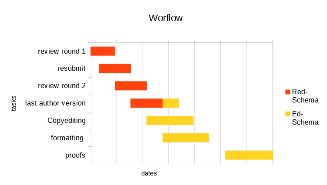
Figure 1. Workflow pattern

The graph in figure 1 is a simplified representation of the annual workflow of the journal Philosophie Antique . Each article submitted and published by the journal goes through the same process.