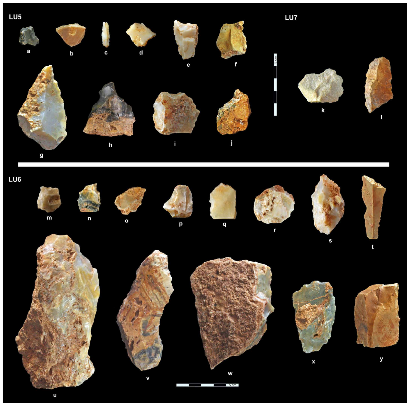
Fig. 3. Select artifacts from LU5 to LU7. Flakes unless otherwise noted. a, scraper; b, backed flake; c, bladelet; d, piercer; e, piercer on blade-like flake; f, piercer; g, combined tool (burin and scraper on chunk); h, nosed scraper; i, combined tool (inverse scraper/denticulate/notch); j, denticulate (LU5); k, flake; l, denticulated blade-like flake (LU7); m, piercer; n, denticulate; o, denticulate; p, piercer; q, combined tool (linear retouch/denticulate); r, scraper; s, convergent denticulate (Tayac point); t, blade; u, scraper; v, denticulate; w, linear retouch; x, tranchet; and y, blade-like flake (LU6).

navigate the waterborne transport (32, 42). A Middle Pleistocene terrestrial-access model also has behavioral significance, as paleogeographic reconstructions suggest that the Aegean Basin would have been a region quite unlike anywhere else in contemporary Eurasia; thus, while it offered hominins a range of attractive lacustrine and raw material resources, occupying or even traversing such an environment would have required innovative adaptive strategies.