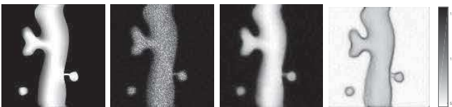
Fig. 3. From left to right: original image, noisy and blurred observation, MMSE estimate computed with Algo 1 and associated 95% credibility intervals.