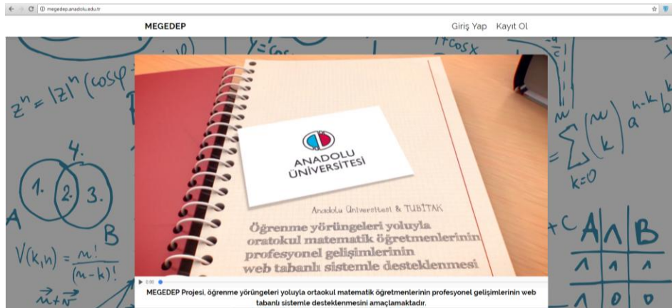
Figure 2: Mergedep’s (Web portal) interface

development regarding algebra content of the (lower) secondary school mathematics curriculum. We specifically focused on algebra content as the researchers in the project team have background knowledge in epistemological issues and misconceptions regarding learning algebra. In order to create such a portal, at first, a domain http://megedep.anadolu.edu.tr was taken, where ‘megedep’ referred to a shortcut of the project’s title in Turkish. Figure 2 displays the (homepage) interface of the website.