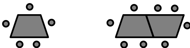
Figure 5: Chairs round tables

they had expressed the rule of 2n+3+3 . The articulation of 2 \times 47 + 3 + 3 rather than the single number of 100, which would be the result of carrying out the arithmetic of that expression, meant that the structured way in which they viewed the tiles was contained within that expression. The stressing of the structure allowed them to see the generality that, however long the rectangle was, they needed two lots of that length plus another two sets of three tiles. A significant aspect of this anecdote is that the rectangle was long enough so that they would not attempt to build this and count the number of tiles. As Radford (2010b) noted, it is important to work with a case where the numbers involved are too big for a learner to carry out arithmetic or to count. This forces the need to seek structure. Indeed I go further and say that in order to head towards algebra in such situations, all arithmetic should be avoided.