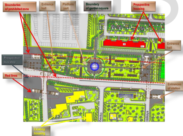
Fig. 3. Fragment of landscape plan

Then, in order to further improve its safety, was selected (such as rebar) for construction materials [14], [20]. Were provided the required level of reliability, by the way, it was appeared all together and to complete the final design of the subway station structural elements [20]. And finally were elaborated landscape plan [21] as shown in Fig. 3 and scheme of transport accessibility and pedestrian traffic according future site plan as shown in Fig. 4. Summarizes the results of these analyzes, was proved that future site plan of station «Yuzhnaya» is most acceptable land use that suited for residents.