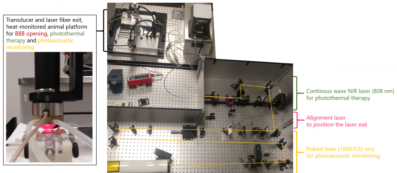
Figure 1. Integrated experimental setup.

In our setup (Fig.1), three laser sources were aligned in a single optical fibre to achieve three main tasks: alignment, photothermal heating and photoacoustic signal generation. The last one uses a pulsed laser (Quantel, France, Nd:Yag, 1064 nm, 330 mJ, 5 ns, 10 Hz, frequency doubled by a KTP crystal at 532 nm) and focused transducers (diameter 25 mm, focal depth 20 mm, central frequency 1.5 MHz, Imasonic, France) in order to achieve real-time monitoring. The collected signal is driven into an oscilloscope (PICOSCOPE 5243A from PICO TECHNOLOGY, 2 Channel, 100 MHz, 500 MSPS, 64 Mpts, 5.8 ns) for signal analyses. A Matlab graphical user interface code was developed to control different instruments on the setup. The second laser source is a continuous wave (CW) laser diode (Thorlabs L808P1000MM, 808 nm, 1000 mW) mounted on a TE-Cooled Mount (Thorlabs, LDM90/M) in which the temperature and the current are controlled using Benchtop Laser Diode TEC Controller (Thorlabs, ITC4005, 5A/225W).