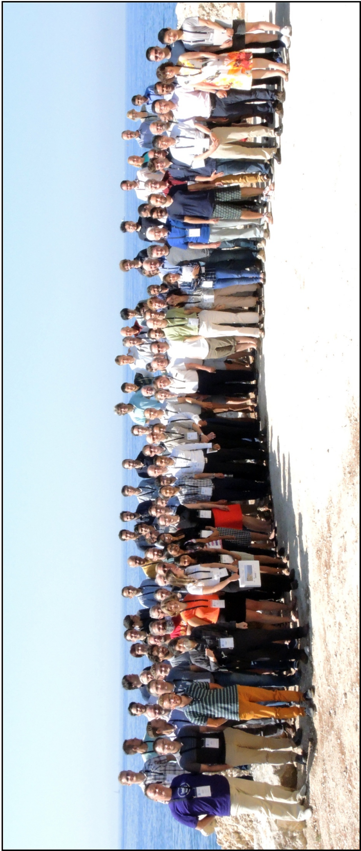
BBVIV-7 group photo – 4 July 2018