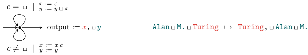
■ Figure 3 A DSST that updates two registers, named x, y , based on whether the input letter c is the blank space or not.

languages. For example, synchronization languages contained in (\Sigma\Gamma)^*(\Sigma^* \cup \Gamma^*) , which enforce a strict alternation between input and output letters, capture the class of automatic relations. This latter class is closed under all boolean operations (union, intersection, complement), and has a decidable equivalence problem and several other nice algorithmic properties [71]. The idea of defining classes of relations based on synchronization languages was investigated in detail in a series of works [43, 47, 36, 35].