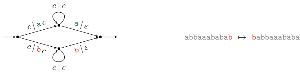
■ Figure 2 A 1NFT. An arrow labeled by c | v represents a transition that consumes an input letter c \in \{a, b\} and appends the word v to the output.

degree of freedom in the possible outputs associated with the original input. The latter type of relation is called NMSO transduction , the ‘N’ standing for non-deterministic. There are of course restricted variants of (N)MSO transductions, where, for instance, monadic second-order quantification is forbidden ( FO transductions ), or where the order on output positions is directly inherited from the order on input positions ( order-preserving MSO transductions ). For example, the transduction of Figure 1 is an order-preserving FO transduction.