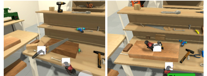
Fig. 4. Example of a worker performing some actions of the scenario.

In order to test and evaluate our prototype, we proposed the following woodworking scenario: the worker gets a piece of wood from his left (mass: 4kg, distance 60cm) and places it on the table front of him. Then, he uses the saw on the shelf in front of him to saw the piece of wood (~ 10 times). He gets the electric drill in front of him and drills the piece of wood (Figure 4). Then, He controls the drilled wood. Finally, he gets that piece wood and walks to the table on his right to place it.