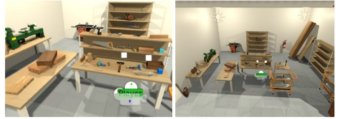
Fig. 1. The designed 3D environment to simulate a carpentry workshop

As a result, replicas are equipped with professional tools (saw, hammer, drill ...). The goal is to cover all basic movements according to MTM-UAS and their corresponding forms.