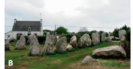
Fig. 2. Very large vertical standing stones. The large broken menhir of Locmariaquer (A), the alignments of Kerzerho at Erdeven (B), and the quarry of Roch O'Couet (C), in the Morbihan. A gallery grave was subsequently built in this quarry. Photos L. Laporte, Scanner 3D CNPAO-UMR 6566/Study P. Gouézin (2017).