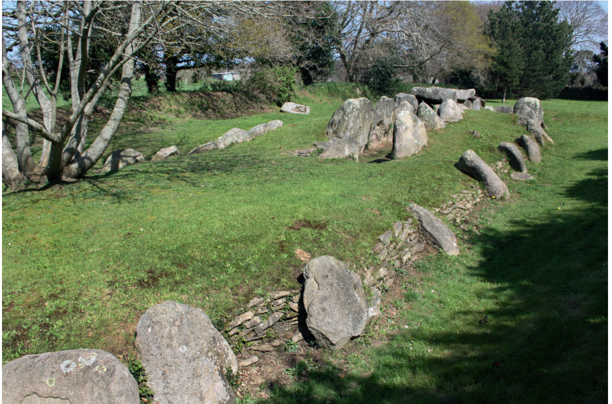
Fig.7. Monumentalities at the end of the Neolithic – Crec'h Quillé passage grave with a short lateral entrance in Côtes d'Armor.

even Angevin type, are now attributed to the very end of the 5 th millennium BCE, or even rather to the first half of the following millennium.