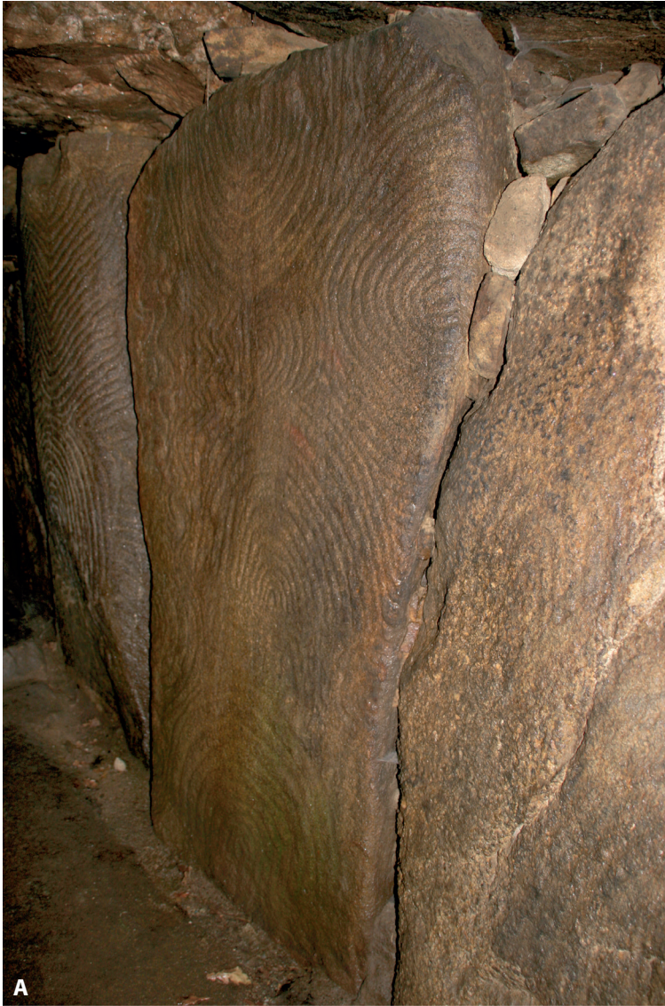
Fig.4. Staging. Engraved decorations at Gavrinis (A) and painted decorations at Barnenez H (B).