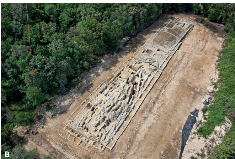
Fig. 1. Monumentality of mounds. All are singular, in particular the most imposing ones, as they are the outcome of the specific history of each place, but they often result from similar dynamics. Our knowledge of the history of each place is also deformed by the period of study, which reflects the development of research in this domain: mound of the Tumulus St. Michel explored between the middle of the 19 th century and the beginning of the 20 th century (A), and tumulus C of Péré studied at the end of the 20 th and beginning of the 21 st century (B).