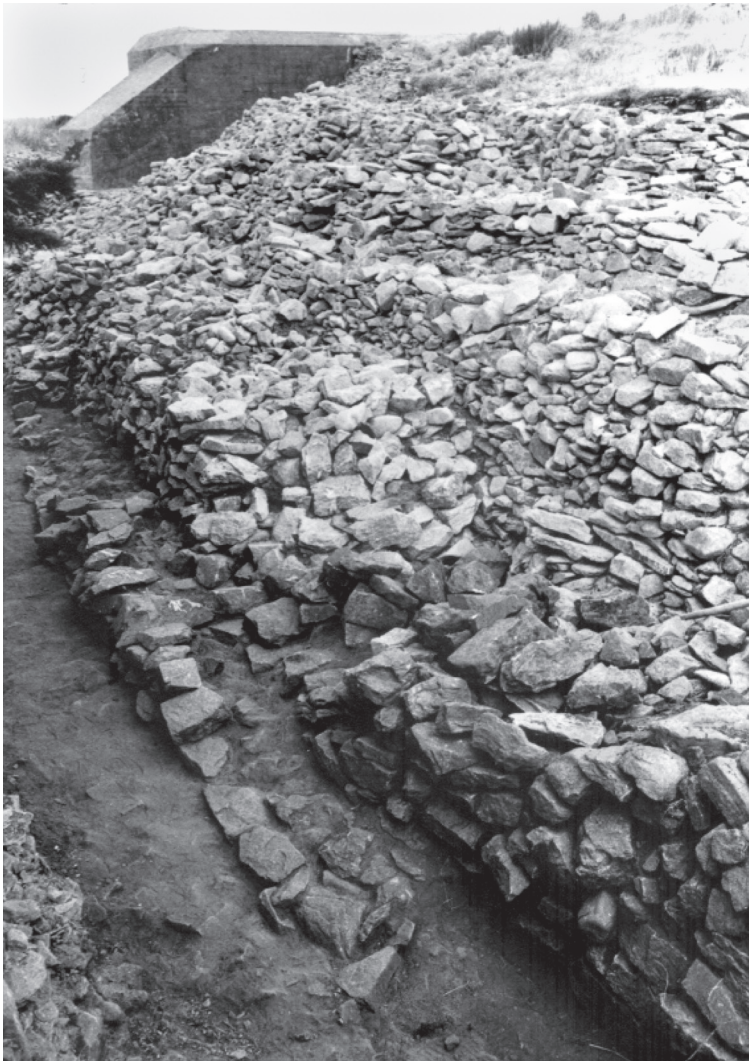
Fig. 6. Small and large stones: external arrangements - facade of the Petit Mont at Arzon (Morbihan). Excavations J. Lecornec.

In most cases, the position of entrances often becomes very diffi-