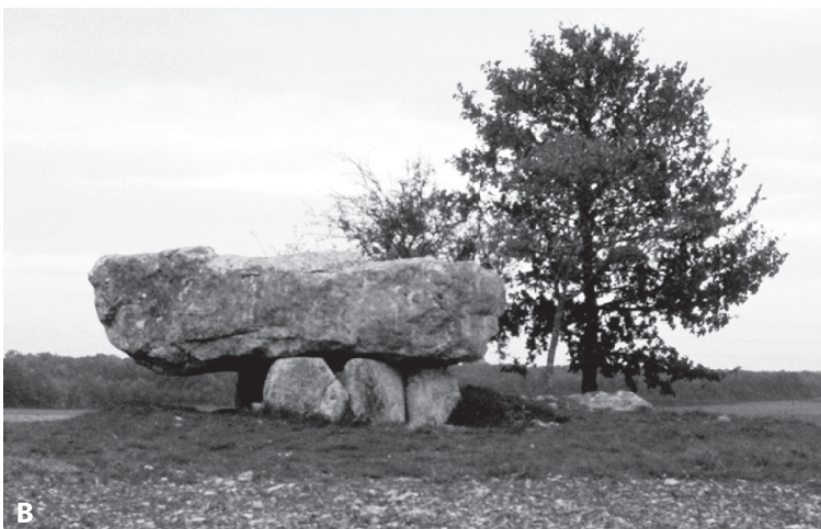
Fig.3. Very big horizontally moved stones. Thick capstone above chamber III with dry-stone walls of tumulus C at Péré at Prissé-la-Charrière in the Deux-Sèvres (A), or above the sepulchral chamber of one of the two monuments of la Perrotte at Luxé in Charente, with walls comprising finely worked limestone orthostats (B).