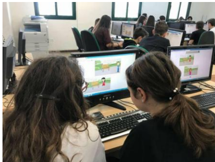
Figure 2: Students’ interaction with the problem story

other things: “We think this method is important, not only from a didactic point of view but also to keep us together and to engage those who usually do not take an active role during the classroom activities. The questions, asked in the form of comics, intrigued them very much, and that first meeting made them impressed” (Figure 2).