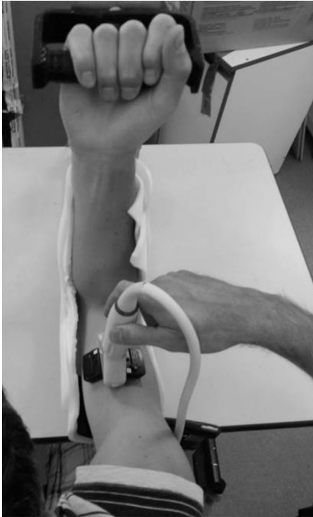
Fig. 1 Illustration of the experimental setup

The ultrasound probe was placed on the biceps brachii belly, carefully aligned with the shortening direction of the muscle, and perpendicular to the skin (Fig. 1). The location of the probe was marked on the skin to allow the same placement across trials and days. Since the biceps is fusiform, the shear wave propagation was measured in the fiber direction (Nordez and Hug 2010). Maps of the shear elastic modulus (Fig. 2) were obtained at 1 Hz with a spatial resolution of 1 \times 1 mm. The Aixplorer scanner may present a temporal delay in signal processing between calculation and visualization of shear elastic modulus maps (Sasaki et al. 2014). Such phase shift was avoided in the present study by removing the persistence of SSI mode.