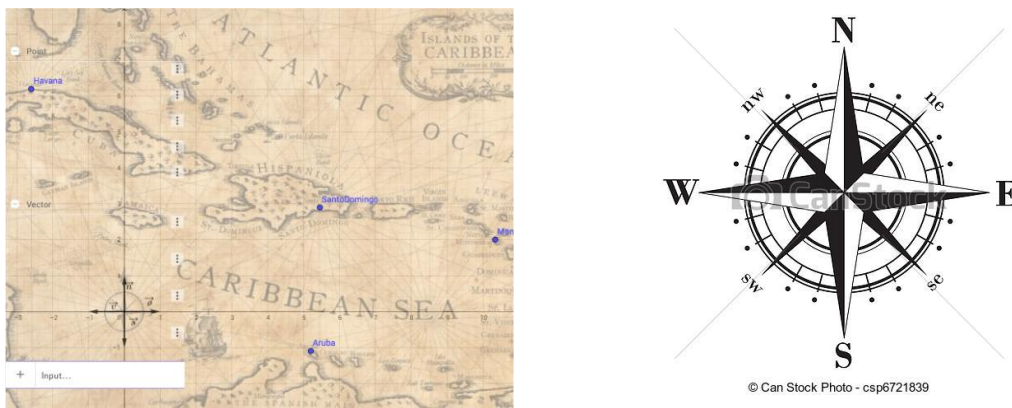
Figure 2: A screen dump showing the Geogebra file and the compass rose handed out

the distance from Aruba to Montserrat in 3 days and you expect to travel by the same average speed. What orders would you give your crew and when do you expect to arrive?”