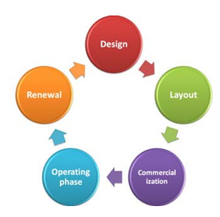
Figure 1: Industrial park life cycle

To secure environmental performances of "Les Portes du Tarn" park, life cycle thinking is necessary. This life cycle thinking approach defines 5 main life cycle phases (figure 1): "Design", "Layout", "Commercialization", "Operating", "Renewal" (Adoue et al. 2015). In addition, during the commercialization phase, life cycle assessment (LCA) method should be used to evaluate the environmental impacts of expected industrial synergies (Mattila et al. 2010).