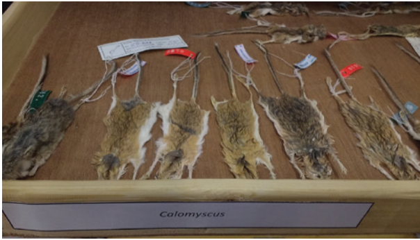
Figure 3: Darvish rodent collection at the Ferdowsi University of Mashhad.

A drawer containing skins of Iranian mouse-like hamsters ( Calomyscus ).