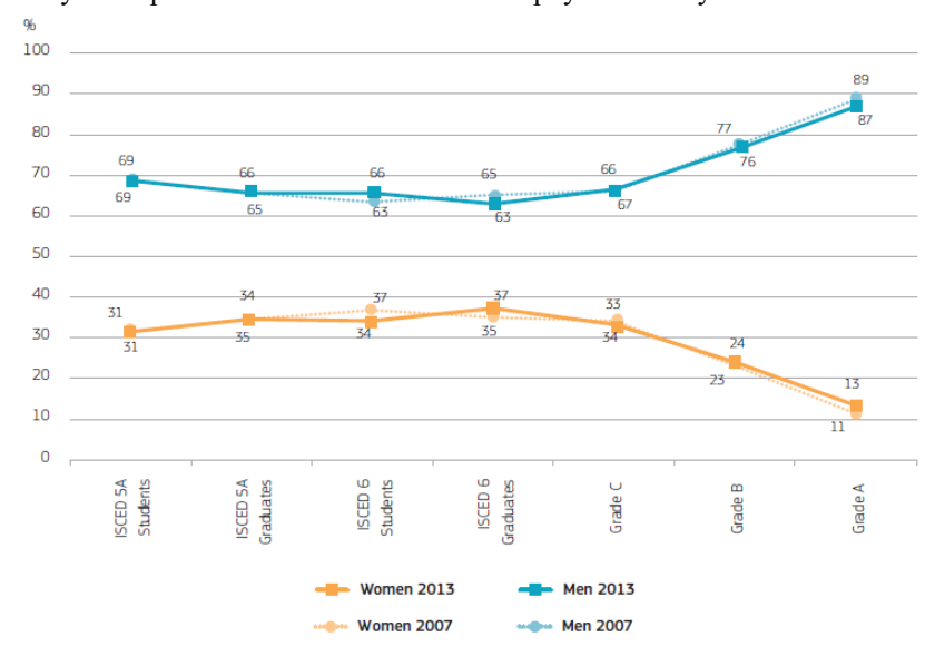
FIGURE 2. Statistics of women and men in a typical academic career in science and engineering, for students and academic staff in Europe in the 2007–2013 period. This curve is called "the scissors curve" (from [1]).

In Europe (EU-28), only 30% of the researchers in the government sector (all fields included) are women, and the proportion falls to 20% in the fields of sciences and technology [1]. In all European countries, when the physicists' figures are available, they are very similar to the one for science and engineering (Figure 2). The percentage of women researchers in physics is 13% in Germany [2] and 16% in Ireland [3]. In the UK, women are 9% of professors, 19% of senior lecturers or lecturers, and 19% of researchers [4]. In the Netherlands, in the Foundation for Fundamental Research on Matter (FOM), only 10% of the scientific staff is female, whereas 24% of PhD students and post-docs are female [5]. In France, 21% of physicists are women (varying between 16% and 25% depending on the physics domain; see Table 1. The situation is not really better in the United States, as the American Institute of Physics reports that less than 23% of U.S. physics faculty members are women [8].