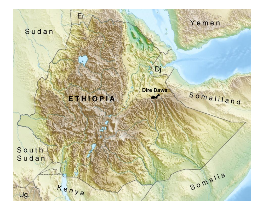
Figure 1 . Localisation of the Dire Dawa Federal State (black area) in the map of Ethiopia (Er - Eritrea, Dj - Djibouti, Ug - Uganda). Note the position of Dire Dawa between the Afar lowlands in the north (covered by the dry savannah) and the Chercher Mountains in the south and south-west (covered by the evergreen Afromontane forest).