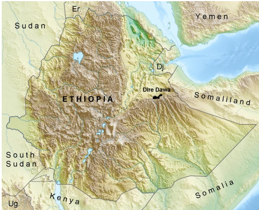
Figure 1. Localisation of the Dire Dawa Federal State (black area) in the map of Ethiopia (Er – Eritrea, Dj – Djibouti, Ug – Uganda). Note the position of Dire Dawa between the Afar lowlands in the north (covered by the dry savannah) and the Chercher Mountains in the south and south-west (covered by the evergreen Afromontane forest).