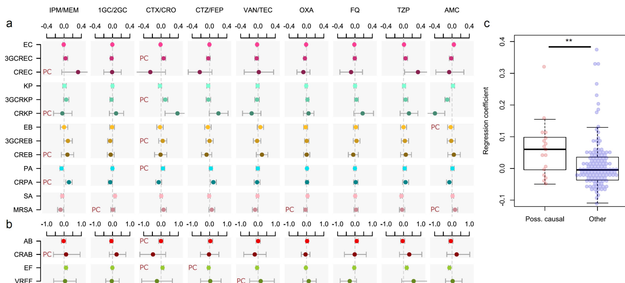
Figure 2. Possibly causal associations between the use of specific antibiotics and the incidence of infection with ESKAPE 2 pathogen variants. Shown are the \hat{\beta} coefficients (points) and 95% confidence intervals (bars) of Poisson regression models of the incidence of each variant in each ward (n=357) for consumption volumes of 9 antibiotic groups, after controlling for sampling bias and connectivity. Associations classified as possibly causal (n=17) are indicated by a ‘PC’ mark. Models involving A. baumannii and E. faecium , which exhibited larger 95% CIs due to smaller incidence of the resistant variants, are shown with separate scales (panel b) for readability. (c), the coefficients of possibly causal associations are significantly higher (p<0.01, Mann-Whitney U-test, two-sided) than the coefficients of other associations. The center line indicates the median; box limits indicate the upper and lower quartiles; whiskers indicate the 1.5x interquartile range; points indicate the individual coefficients.

spuriously correlated with AMR, the strength of an association between the use of an antibiotic and the incidence of a variant should not depend on whether the association fulfills the criteria for possible causality.