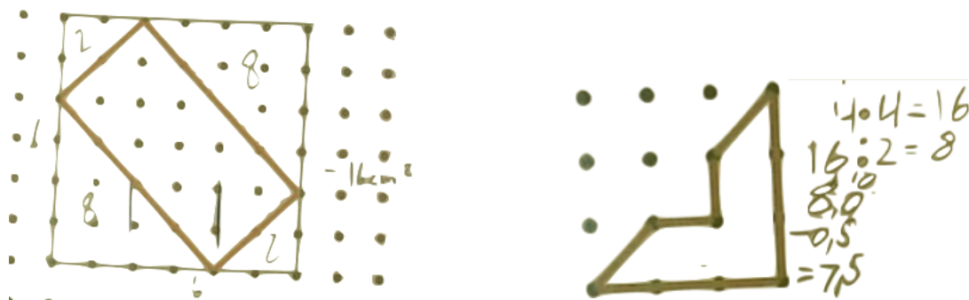
Figure 2: Test sheets of students using restructuring as a strategy applied in the Red task in the posttest resulting in a correct answer, and in the Brown task in the pretest making an error

The six students who got a wrong answer made various mistakes. Four of them give a clear explanation of the procedure of embedding the rectangle in a larger square and “subtracting what is in the corners which is not in the red [rectangle]”, but proceeded with computing the wrong area of the square (one student got 7 \times 7 as a result) or computed the wrong area that had to be subtracted (three students). Of the other two students the source of the error is unclear.