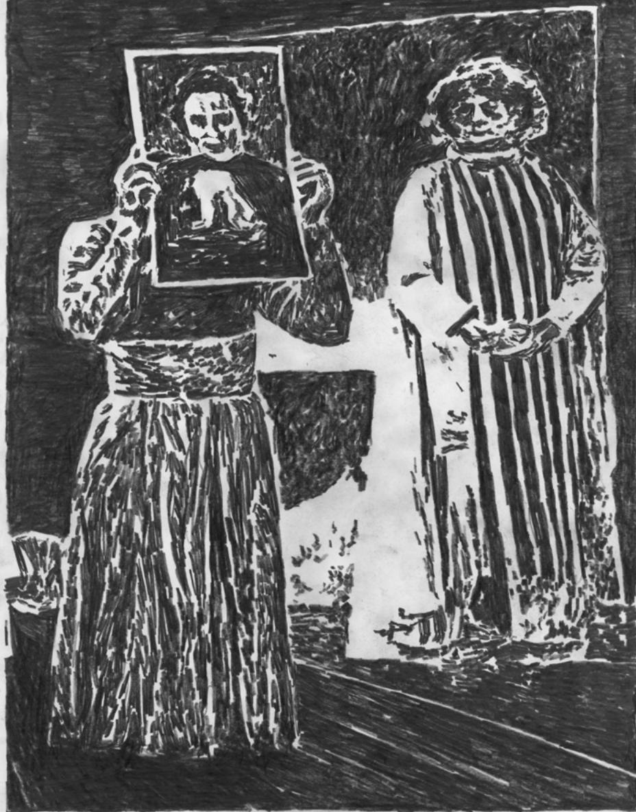
A Light That Failed Completely