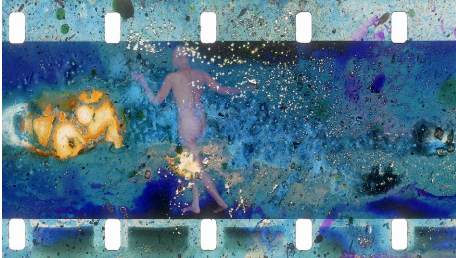
Fig. 7 Barbara Hammer, Evidentiary Bodies (still), 2018 (detail). Three-channel HD video installation (colour, sound). Dimensions variable; running time: 9 mins. 30 secs. Courtesy of The Barbara Hammer Estate, COMPANY, New York, and KOW, Berlin. © The Barbara Hammer Estate.