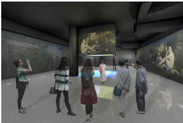
Fig. 6 Chateau d’Auvers sur Oise, Virtual visit on Impressionism

On an applied level , this project will contribute to the design of artistic environments (actual and virtual) and add knowledge to the benefits of using AR, VR and Artificial intelligence to complement the experience. It will help improve the quality of the experience of visiting museums, biennales and outdoor art and lead to new interdisciplinary strategies to design art spaces as systems (SMART environments) 7 . It can also provide information on the benefits of art in stressful situations (hospitals, retirement homes, prisons, homeless shelters, business districts, schools, etc.) and help conceive integrative, adaptive environments. This research may yield results useful to the field of museum studies, art mediation, art therapy.