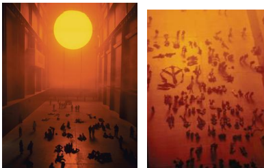
Fig. 1.1 Eliafur Eliasson, the Weather project, 2003, Tate, London

In Eliasson's installations, the architecture is similarly both present and absent. It appears and disappears with the flow of images, creating a rhythm, a beginning and an end ( fig. 1.1 ).