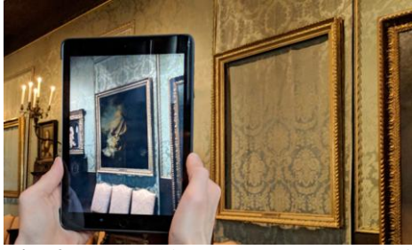
Fig. 2 AR used in a museum to add information (a missing painting)