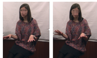
Fig 1. Multimodal activity during a silent pause: implicitly seeking help from the interlocutor

In the first example, the non-native speaker (NNS) is talking about travelers who get to stay in a foreign country for a longer time, but she mispronounces the noun “longer” ( plus longtemps ). She quickly realizes her mistake, and as Fig. 1 shows, she then produces a silent pause of 580 ms, but she also holds her hands in the same position, and with her gaze fixed on her interlocutor she slightly moves her head in the direction of her partner, to elicit help.