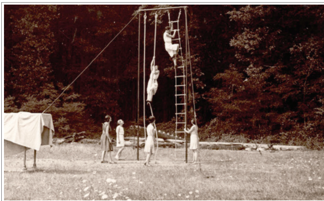
IMAGE 3. Climbing exercise on the big training stadium. Undated.

one for rhythmic dances, an 80-meter long straight track and further down two vegetable gardens. There is a third stadium: the sports games stadium, consisting of a tennis court, a basketball court and a 250-meter circular obstacle course. The total area, which was landscaped by Édouard Redont (1862-1942) covers 17,265 square meters.