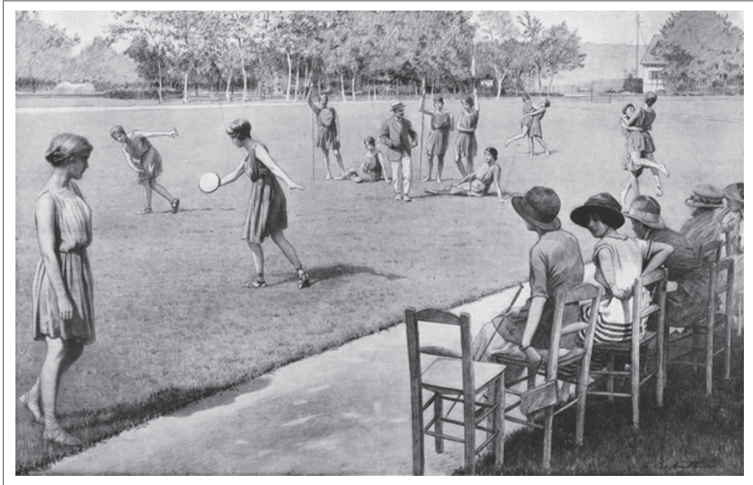
IMAGE 1 : « A lively fresco by Puvis de Chavannes that shows how only steps away from fancy Deauville, naval commander Hébert reintroduces the art of correct posture and harmonious movement. At the centre, Mr Georges Hébert is seen directing demonstration exercises by the female instructors of the Palestra ». Drawing by Louis Rémy Sabattier (1863-1935) published in the newspaper L'illustration of 30 August 1919. Private collection.

Note : In this representation of the Palestra, Georges Hébert seems to be « parading » surrounded by the female instructors which gives more the impression of a harem than a physical education training centre. It is likely that this illustration may have caused misunderstandings about the work of Georges Hébert.