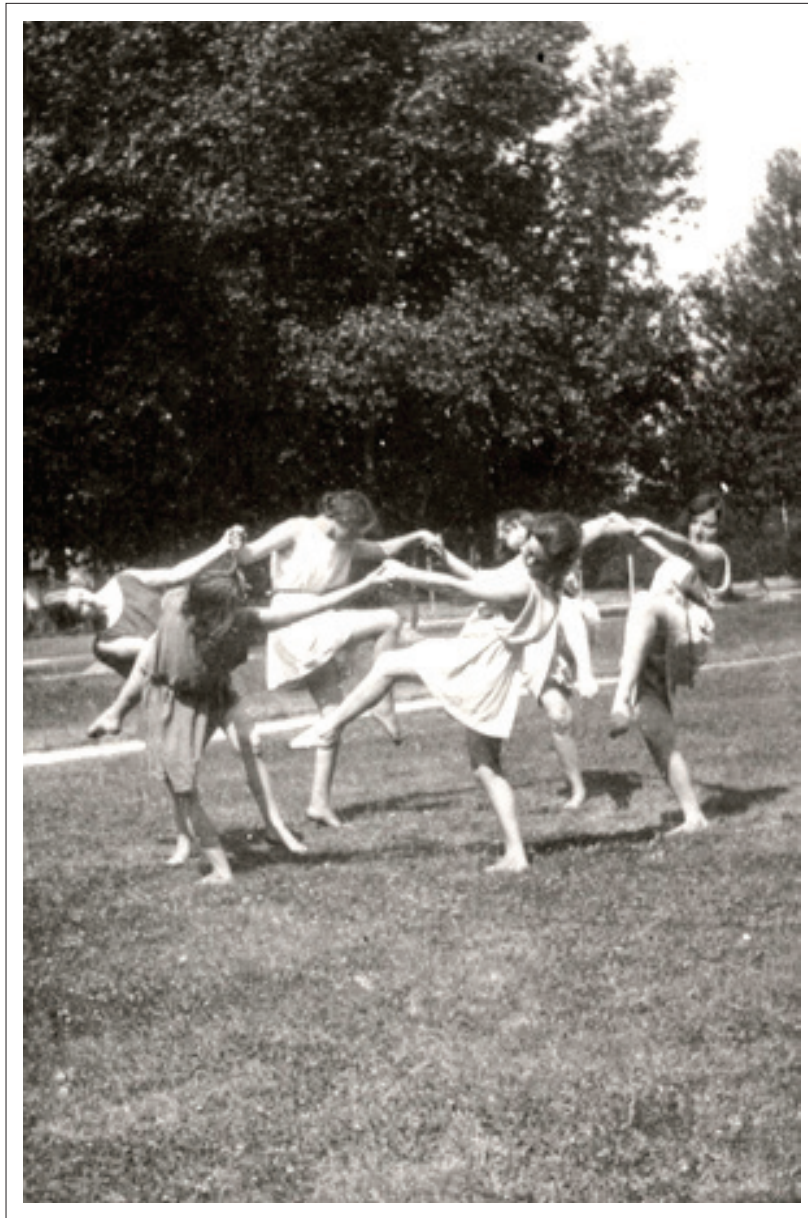
IMAGE 5 : Natural dance at the Palestra. Undated. Private collection.

Note : The natural dance movements at the Palestra look very similar to the movements of Duncan's Hellenic dance or Émile Jaques-Dalcroze's rhythmic dance, but the music in natural dance follows the movements, not the other way around.