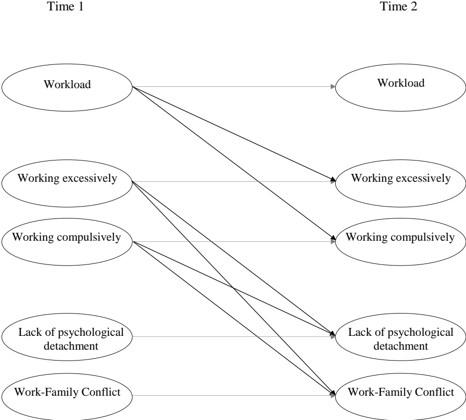
Figure 1. The proposed model.