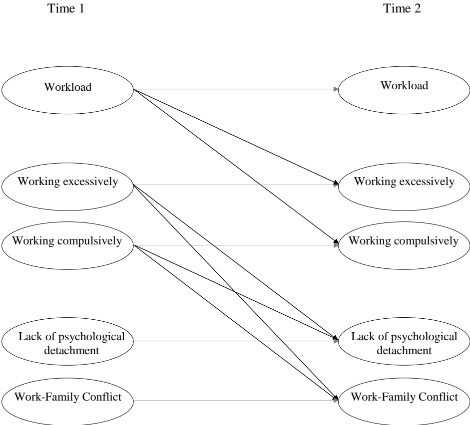
Figure 1. The proposed model.