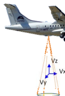
Figure 1: ATR42 aircraft, with trapdoor localization and lidar scanning representation

The lidar is installed inside the SAFIRE ATR42 looking through a trapdoor in the floor of the plane in nadir pointing (Figure 1 & Figure 2).