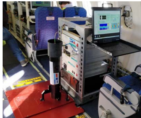
Figure 3 : picture of the LIVE lidar installed inside the ATR42

(Figure 4). For those flight tests, 3D wind vectors retrieval from a whole conical scan pattern will be post-processed using the VAD sine-wave fitting procedure [11] after aircraft attitude and speed correction.