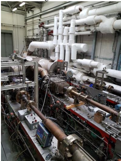
Figure 1. M1 test facility

During JETSCREEN project, tests at different scales, from laboratory to combustor rig, will be performed. In this work we present the test done at ONERA combustor rig M1.