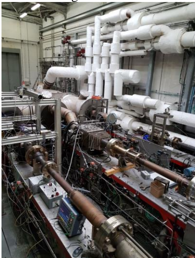
Figure 1. M1 test facility

During JETSCREEN project, tests at different scales, from laboratory to combustor rig, will be performed. In this work we present the test done at ONERA combustor rig M1.