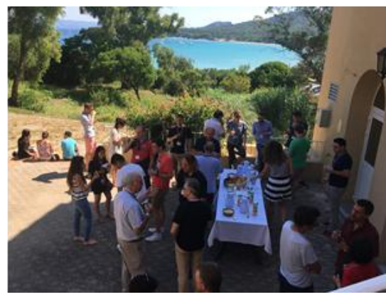
Continuing the discussions during lunchtime and coffee breaks in front of a beautiful sea view.

The dates were chosen to allow the overseas participants to attend the IEEE International Conference on Dielectrics (ICD), which was organized in Budapest during the following week.