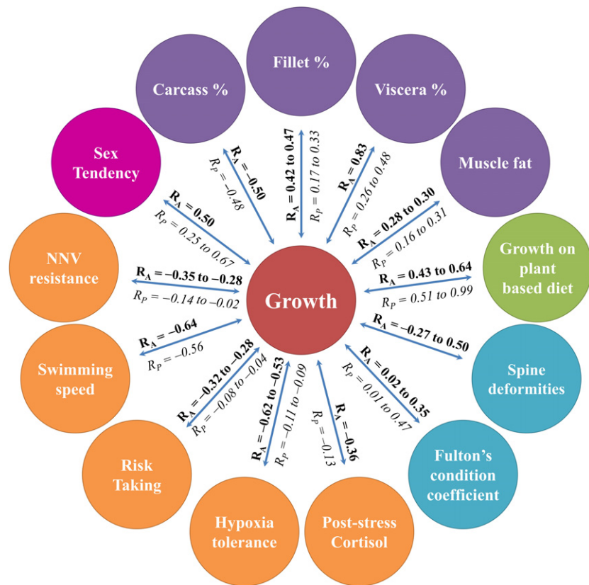
Figure 2 Genetic ( R_A ) and phenotypic ( R_P ) correlations between growth and other traits of interest in European sea bass.

assess the stability of performances across different environments. In sea bass, this is especially relevant due to the high variation of environmental conditions between farming systems and farming areas. At the population level, there was no impact of G \times E interactions on the traits tested except for growth rate, for which SEM fish performed better than did others in warm water conditions in the Red Sea, whereas they were poor growers in other conditions (Vandeputte et al. 2014). There was also moderate G \times E interaction on carcass yield but not on fillet yield, muscle fat content or condition factor. At the family level, G \times E interaction is measured by the genetic correlation between the same trait measured in different environments. Low correlations (and thus high G \times E interactions) were evidenced for growth rate (but not final body weight) between different farming environments. Genetic correlations between the most extreme environments were as low as 0.38, but never negative (Dupont-Nivet et al. 2010; Vandeputte et al. 2014). G \times E interactions were moderate ( r_G > 0.70 ) for quality traits and deformities (Haffray et al. 2007; Karahan et al. 2013).