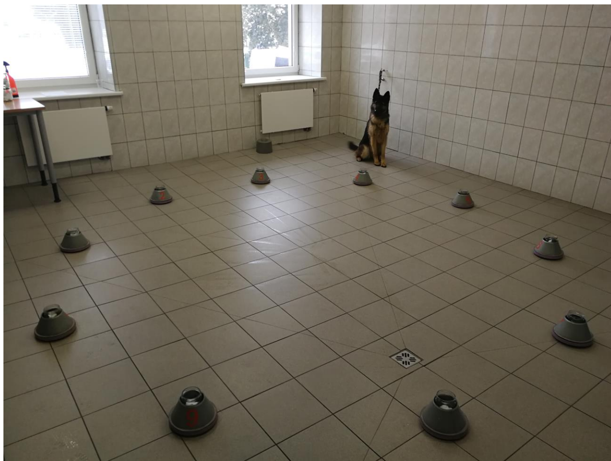
1119 1120 An example of the lineup (Lithuania)